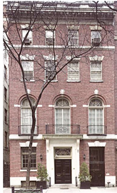
Exterior view of L&M Arts

In financial terms, the coats are far more valuable as an artwork than as luxury goods. Yet the project is not for sale, according to the gallery (nor are images available to the press). The fact that the Hammonses are opting not to commodify their piece—at least for the time being—lends it even greater cachet for hopeful collectors; if scarcity creates value, then unattainability is golden. This conundrum is just one of many raised by this estimable show. — Joshua Mack