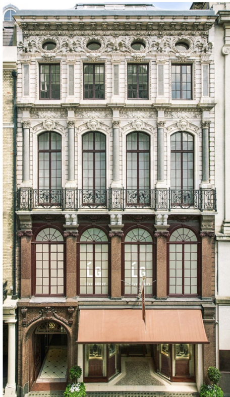
22 Old Bond Street, ca. 1913 and today.

London, UK —Opening 28 September 2018, Lévy Gorvy is pleased to present an exhibition inspired by the legacy of Joseph Duveen, whose former premises at 22 Old Bond Street is now the location of Lévy Gorvy's London gallery. Renowned for his refined eye and exhibition style, the influential gallerist mounted salon-style presentations, complementing masterpieces of painting and sculpture with decorative arts.