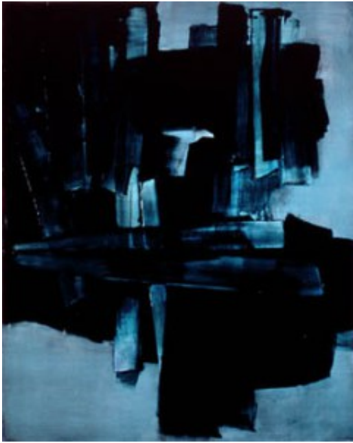
Pierre Soulages 1963