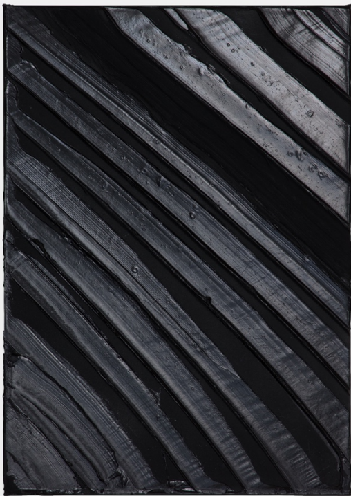
Peinture 81 x 57 cm, 27 septembre 2013, 2013. Acrylic on canvas, 31 7/8 x 22 7/16 inches (81 x 57 cm). © Artists Rights Society (ARS), New York / ADAGP, Paris.

Lévy Gorvy Ground Floor, 2 Ice House Street Central, Hong Kong