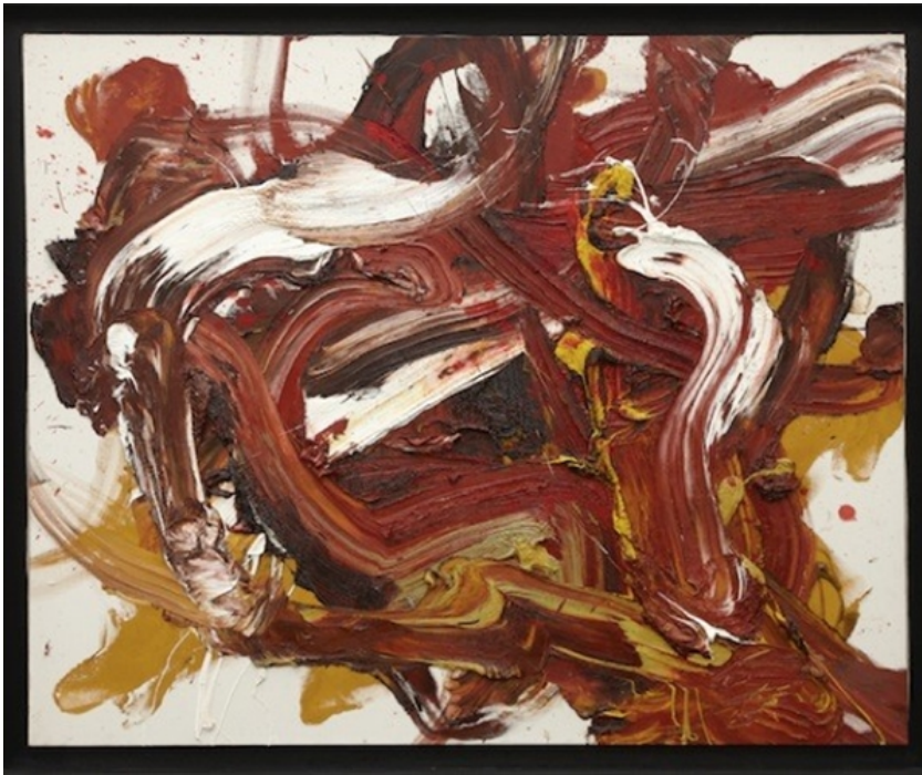
Kazuo Shiraga, Zuisouhen (1986).