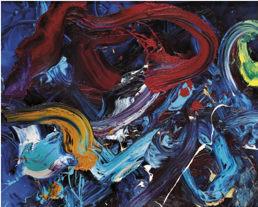
Kazuo Shiraga, Chizokusel Kojoso, (2001).